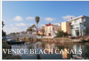
VENICE BEACH CANALS